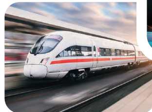
▼ Rolling Stock