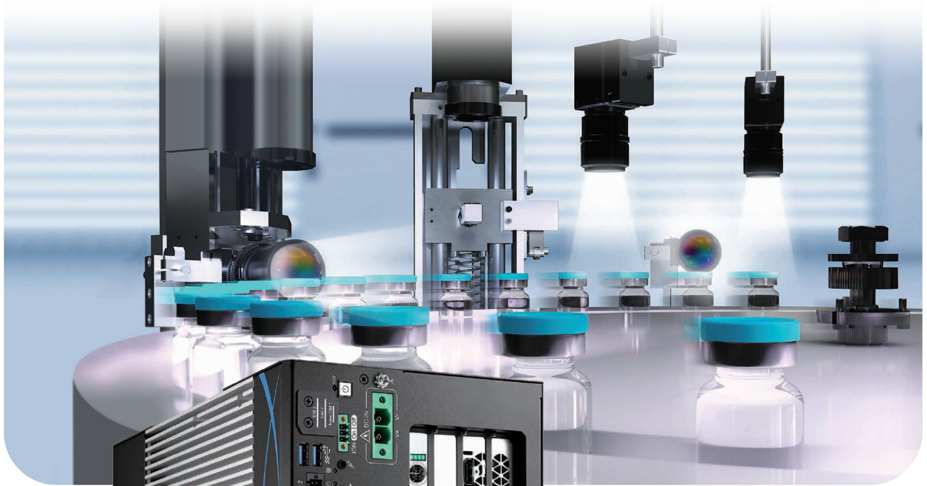
▲ High-Speed AOI

AI Computing System with NVIDIA® Tesla®/Quadro®/GeForce®/AMD Radeon™ Graphics